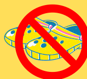
Crocs or Sandals