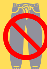
Jeans, Leggings, or Sweatpants