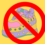
Platform shoes or "Wheelie" sneakers