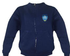
Full Zipper Jacket

Coral Park Elementary School is a mandatory uniform school. Students are required to wear uniforms to school every day. The selected school uniform options may be purchased from a variety of sources, such as uniform companies, department/retail stores and catalogs. The preferred vendor for school logo patches and embroidery is: